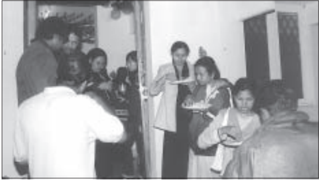
A section of KSM supporters, prayer partners and friends at Christmas fellowship dinner.