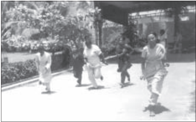
(Left) Tailoring students in the running race at KSM Mission Centre. (Below Left) Tailoring Training students, in bun eating race.