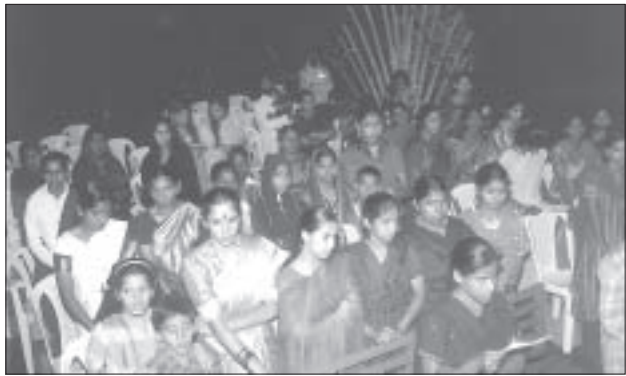
(Left) A section of the gathering.