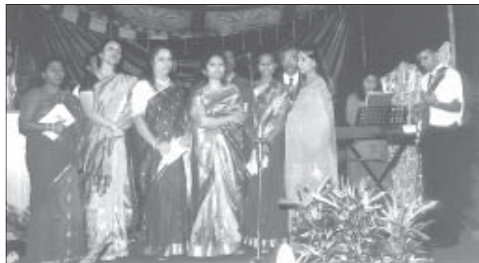
(Above) KSM Medical & Evangelistic staff presenting a few Christmas songs. (Below) Bangalore Mizo Christian Fellowship young people presenting a few Christmas songs.

A section of KSM friends gathered at KSM Mission Centre.