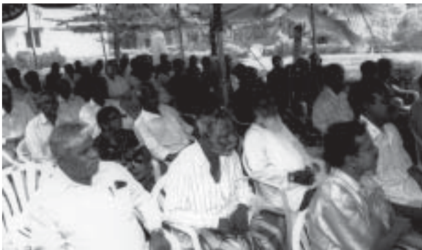
(Left) Gathering at the KSM Mission Centre for the free eye check up. (Right) KSM evangelistic and medical staff presenting a Gospel song at the eye camp function.