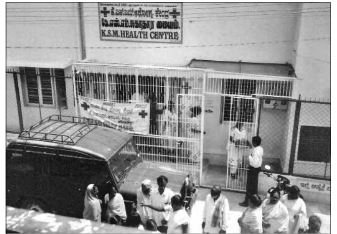
Eye camp patients in front of the KSM Slum Clinic