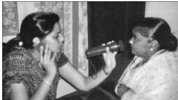
(Below) Selected patients for cataract surgery with the KSM and Jain Hospital medical staff at the KSM Slum Clinic.