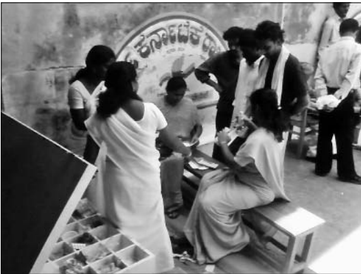
KSM nurses distributing free medicines to prisoners.