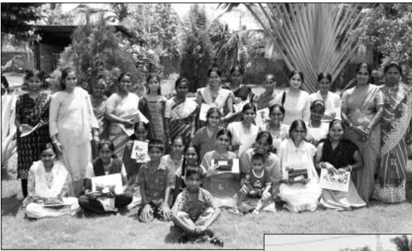
(Above) 28 graduated tailoring trainees from the Koramangala Slum with their teacher.