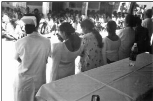
KSM medical team and volunteers presenting Gospel song at the gathering of prisoners at the Kolar District Prison.