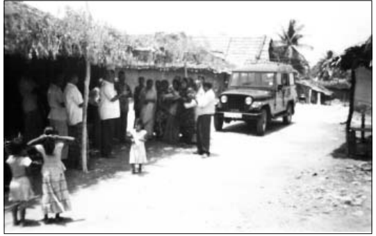
(Top) KSM jeep carrying outreach team and volunteers at Nagavalli village of Chamarajanagar District conducting open air preaching.

In spite of all this, this is the third time that KSM Jeep carried KSM Gospel team on 9th May to Chamarajanagar and camped there. 230 believers consisting of elders, God's servants from Rajajinagar in Bangalore, Agra, Malavalli, Kollegal, Kamgeri, Saligram, Diddapura, Nagavalli and Mysore Brethren Assembly joined the